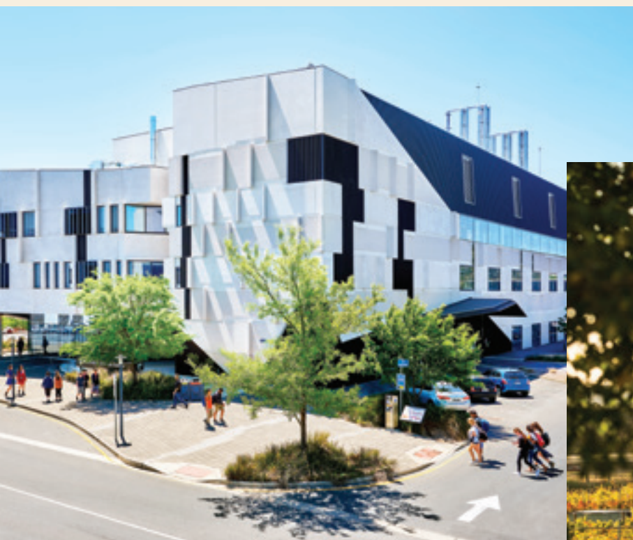
Mawson Lakes Campus