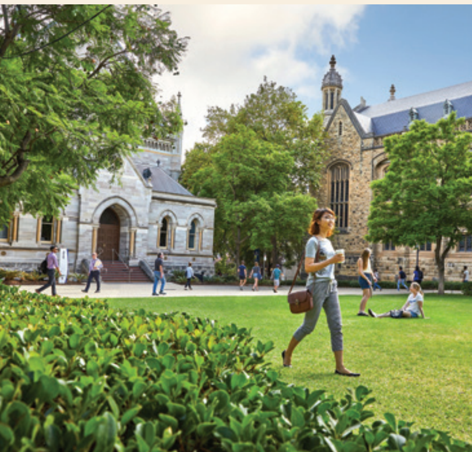
Adelaide City Campus

Unwind between class with access to contemporary fitness facilities across each campus, including heated swimming pools at Roseworthy and Adelaide City campuses. Explore some of the best gardens in the state at Waite campus, or discover the wonders of the universe at the Adelaide Planetarium, located at Mawson Lakes Campus.