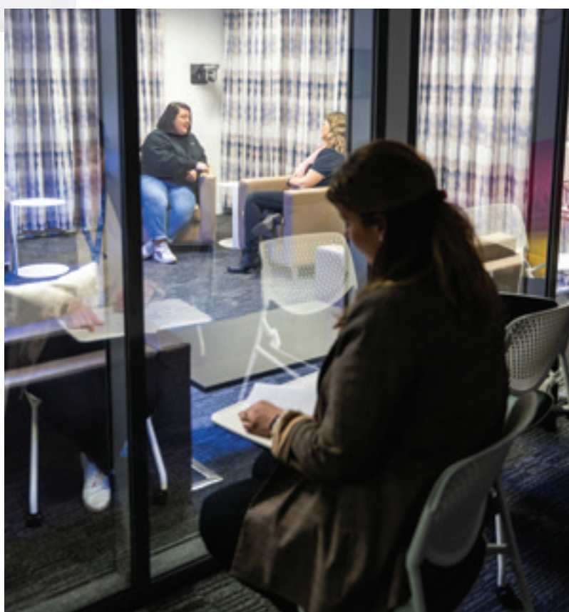
Mount Gambier social work studios

Adelaide University has custom-built social work studios at Magill, Mount Gambier and Whyalla campuses. Equipped with cameras, recording equipment and two-way mirrors, you'll be able to observe simulated scenarios and learn through self-reflection. Supported by field practitioners and academic staff, you'll gain practical interviewing and consultation skills to strengthen your professional practice.