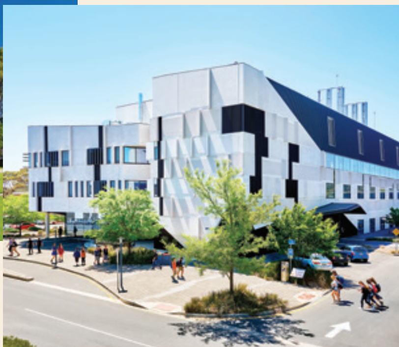
Mawson Lakes Campus