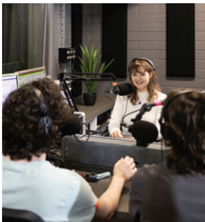
Film and TV studio (top) and digital radio studio

You'll have access to contemporary, industry-standard digital radio studio facilities at our Magill Campus with our student-operated station, UniCast, broadcasting online 24/7. Gain hands-on experience in presenting and producing in a supportive environment as you learn to use commercial-grade radio hardware and software. Become a UniCast volunteer to further your radio experience, an opportunity open to all Adelaide University students. Or, be part of Adelaide University Student Radio, the oldest student-run radio program in Australia, broadcasting on Radio Adelaide.