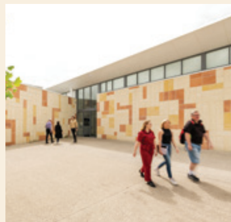
Mount Gambier Campus

You'll never be far from your next class with affordable on campus student accommodation at Whyalla, while city loop buses will get you around Mount Gambier with ease. Our Adelaide City, Mawson Lakes and Magill campuses are easily accessed by public transport. In addition, our Magill Campus can be reached by bus or car with plenty of affordable on campus parking available.