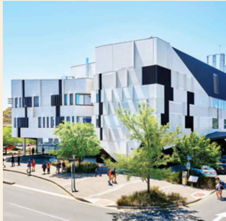
Mawson Lakes Campus